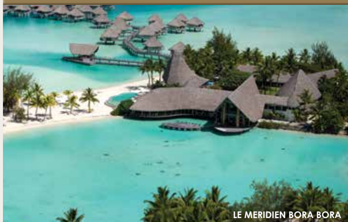
LE MERIDIEN BORA BORA